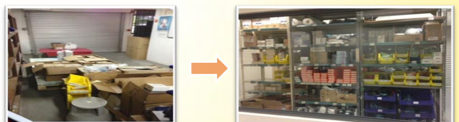
Figure 2: Transformation of the FLC store (Initial vs Current states)

Significant positive changes in store management and user processes were achieved. The team is looking at further improving system rigour and accountability. The success of the project offers other hospital departments with their own in-house inventories the possibility of a cost effective and user driven solution.